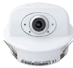
p26 camera, lens B016-B237