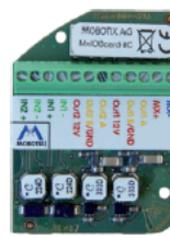
MxIOBoard-IC for signal input/output (accessories)