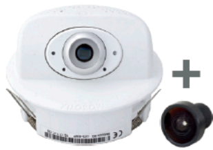
p26 camera body und lenses B036 to B237 for self-mounting