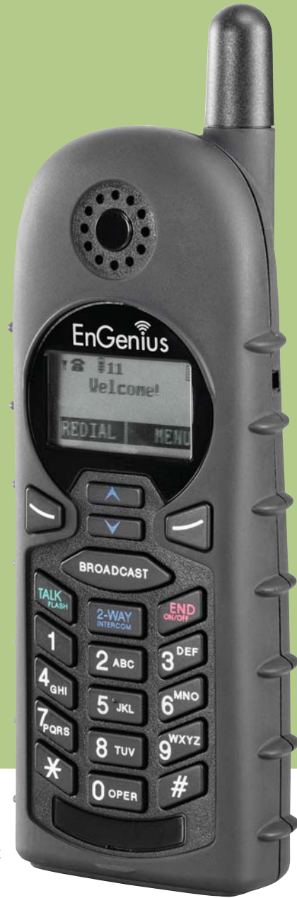
SN 902/ SP922 handset Actual size