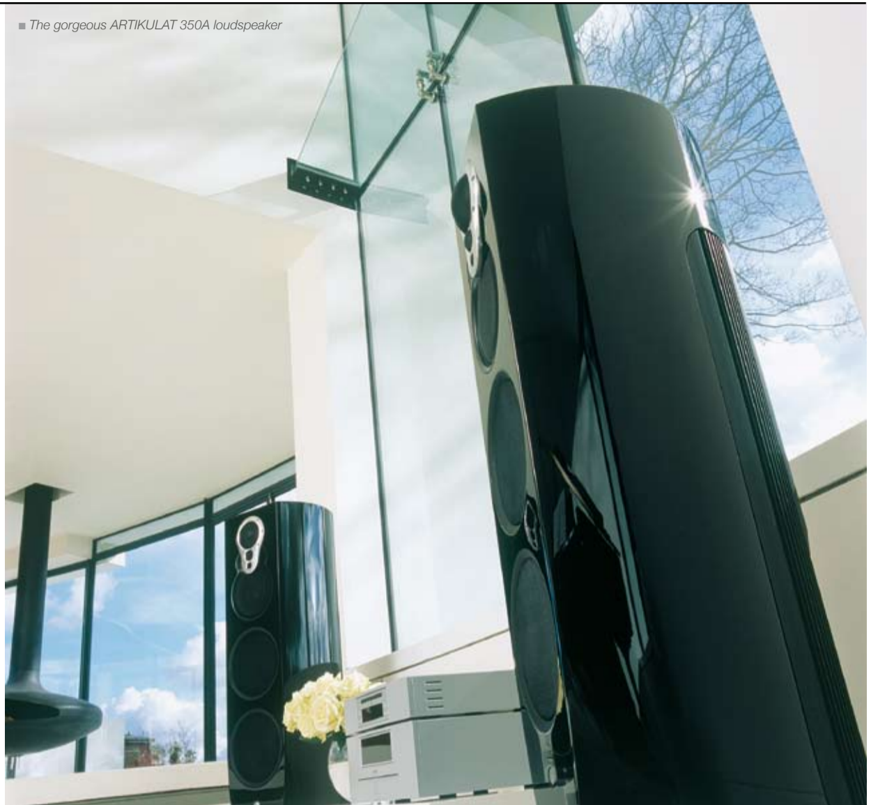
■ The gorgeous ARTIKULAT 350A loudspeaker

together as one team and the result is a real breakthrough – the best integrated AKTIV loudspeaker system in the world. Gorgeous.