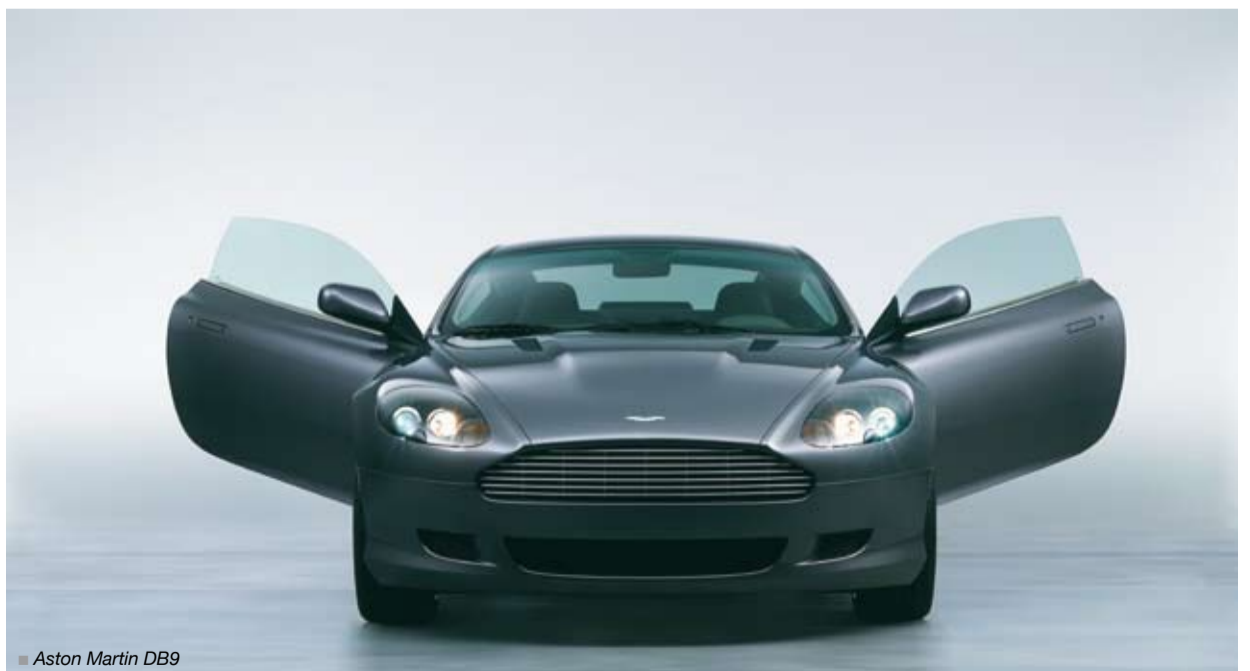
■ Aston Martin DB9

Teamwork is a vital activity in our business - it can be inspirational, it encourages participation, delivers unexpected results, and above all it helps us to build greater value for our customers with every new product or system we make. ■