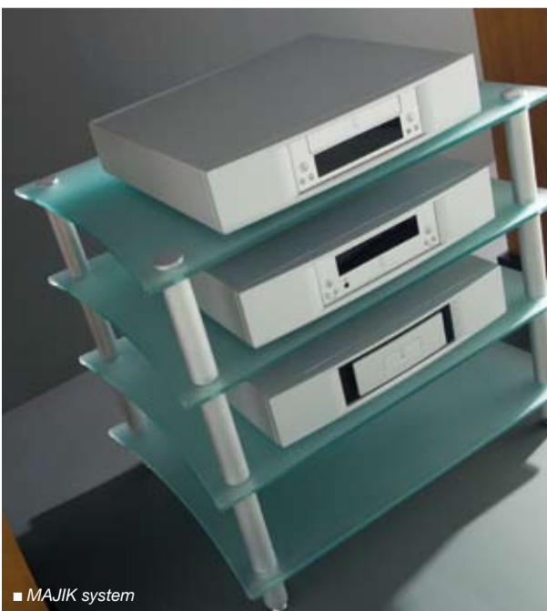
■ MAJIK system

The recent development of the ARTIKULAT loudspeaker system was a great example of the benefits of teamwork. This was probably the most complex product we have ever developed, integrating innovations in cabinet design, drive-unit design and AKTIV amplification and involved a huge degree of cooperation across the company over almost three years. Mechanical, acoustic and electrical engineers worked