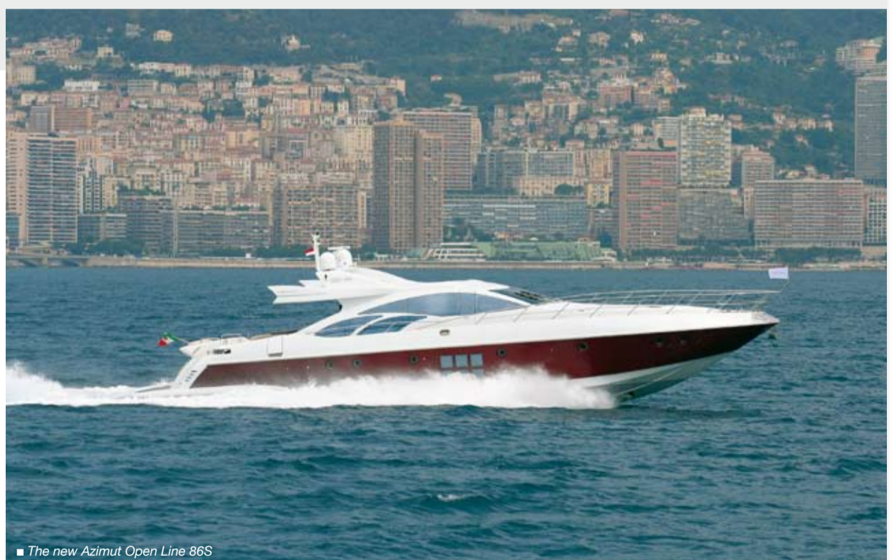
■ The new Azimut Open Line 86S

At the heart of the system is a Linn KIVOR Music Library, providing hard-disc storage of more than 2500 hours of music. The system provides music to eight rooms on the yacht, including, the owner's cabin, the owner's bathroom, VIP cabins and all decks. The music can be controlled independently in each of these main zones, and most cabins are also equipped with their