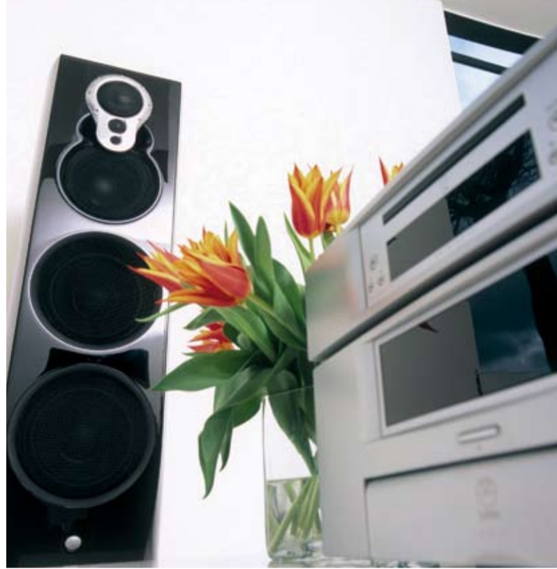
■ The gorgeous sounding ARTIKULAT loudspeaker system